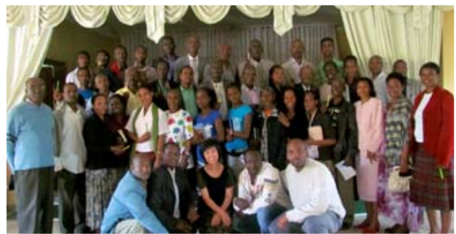
► South Ethiopia Field leadership training.

The participants expressed their gratitude and appreciation for receiving such training to equip them as effective teachers and leaders of children.