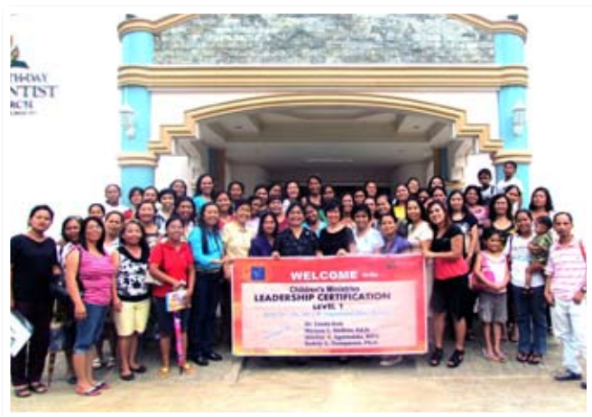
▶ NCMC leadership certification