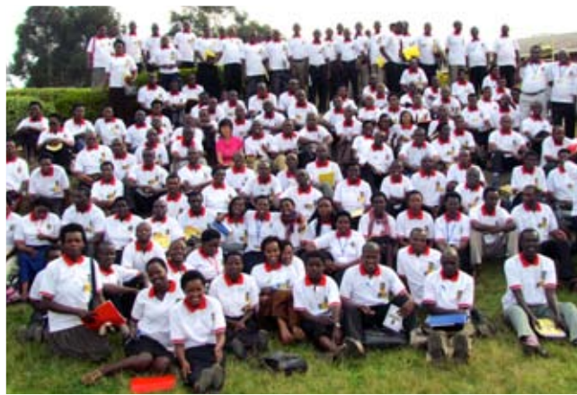
▶ Rwanda Union leadership certification

The highlight on Sabbath was the children's choir who presented beautiful songs. It was an excellent treat for everyone.