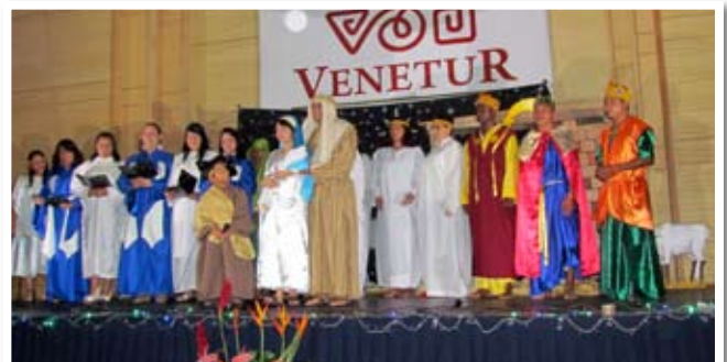
▶ East Venezuela convention

There were exhibitions of materials produced by various conferences, Bible musical dramas, and inspiring testimonies of the children that were won to Christ. This is one of the few unions that subsidized 45% of the cost of the Gracelink Sabbath School lessons. The union officers were all there and were excited to put children as priority. Praise the Lord!