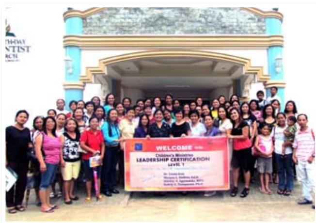
▶ NCMC leadership certification