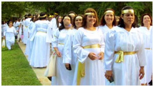
▶ A Drama depicting The New Jerusalem

Sabbath was special as it started out with the demonstration classes of Gracelink teaching on all levels from Beginner to