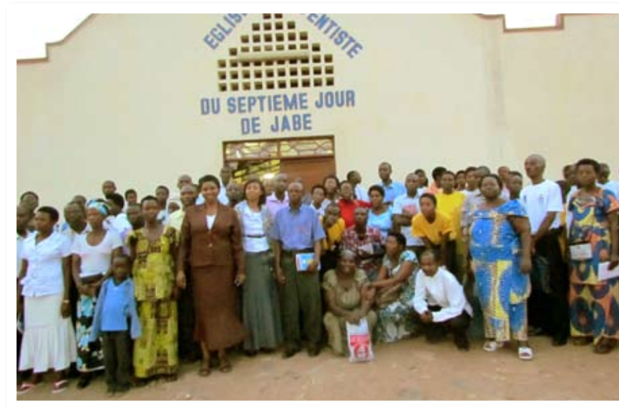
► Burundi Leadership Certification Training