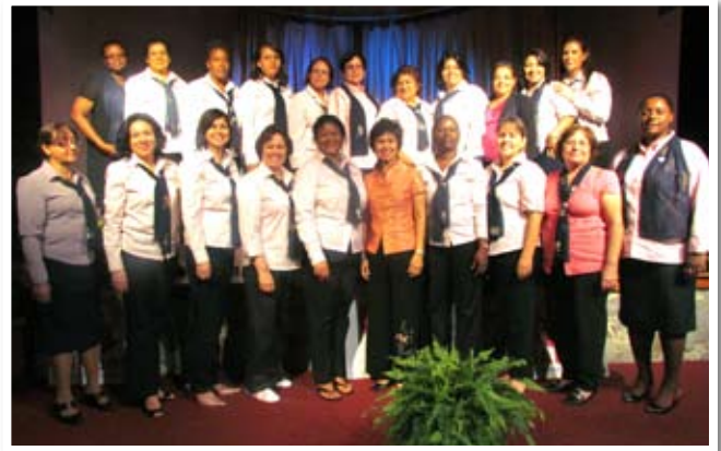
▶ IAD Leaders