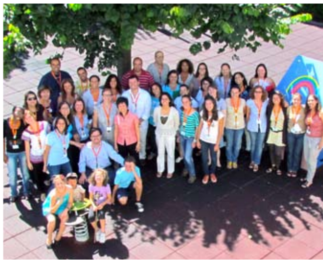
► Portugal Union leadership training