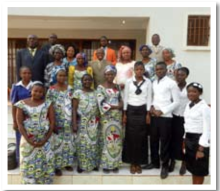
► Lubumbashi Children's Leaders