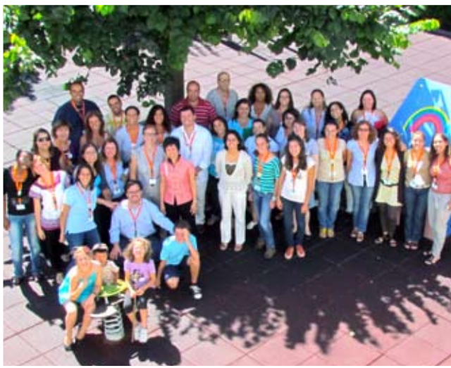
▶ Portugal Union leadership training