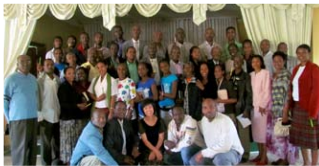
▶ South Ethiopia Field leadership training.

The participants expressed their gratitude and appreciation for receiving such training to equip them as effective teachers and leaders of children.