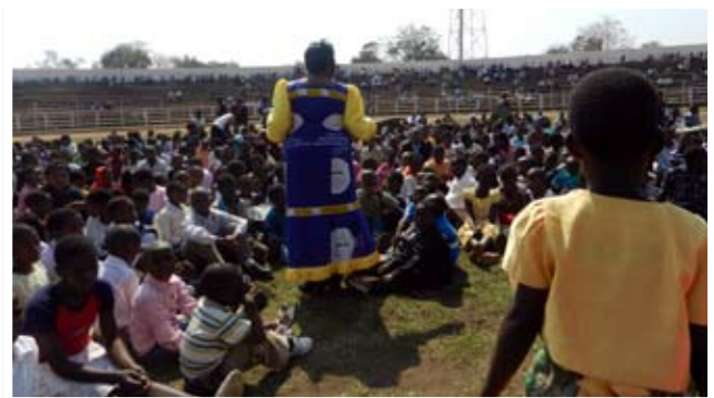
▶ Children at Civo Stadium