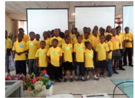
► Bible Brain Box

Bible Brain Box also called Memory gem is a special program developed by the Children Ministries Department to nurture a personal devotional lifestyle