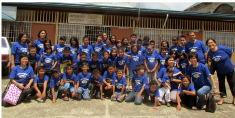
► Little Trumpets