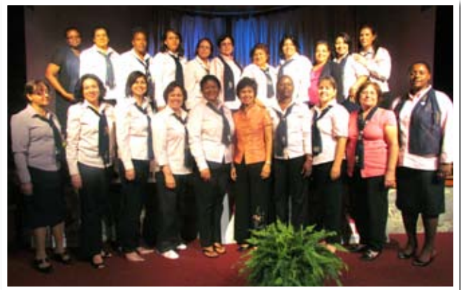
▶ IAD Leaders