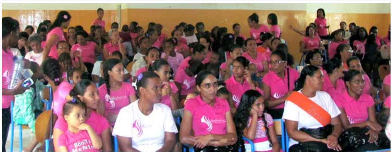
► Women/Children Ministries' Congress – Cape Verde

A bible brain box (memory gem) was held in all the conferences in the Union with the grand finale at Mile 3 Church, Port Harcourt in November 2011 in which children who are able to recite many bible verses were rewarded. The WAD CHM Director chaired the occasion. Audio visual aids such as Television, Video Players etc were given out to deserving churches while every child went home with a copy of the Bible and Steps to Christ.