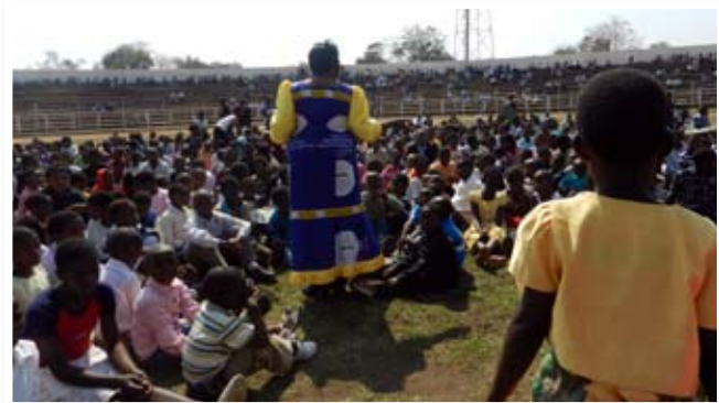
▶ Children at Civo Stadium