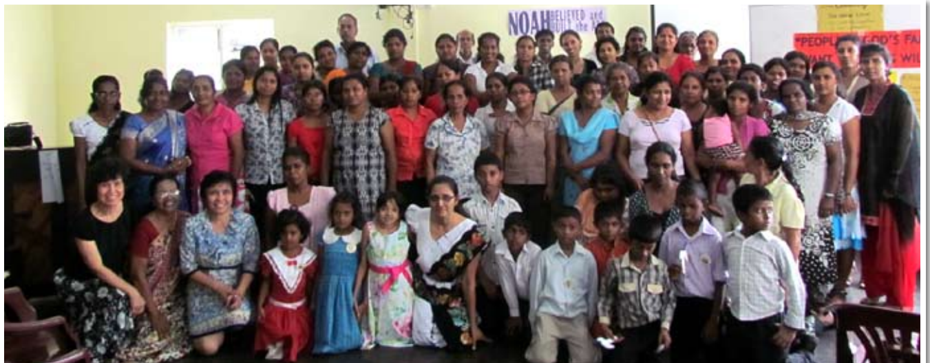
► Sri Lanka Leadership Training