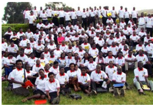
► Rwanda Union leadership certification

The highlight on Sabbath was the children's choir who presented beautiful songs. It was an excellent treat for everyone.